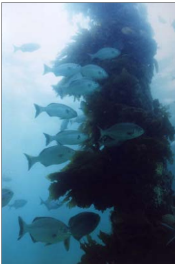
Silver Drummer -M Stacey, Nikonos 5 wide 20 mm