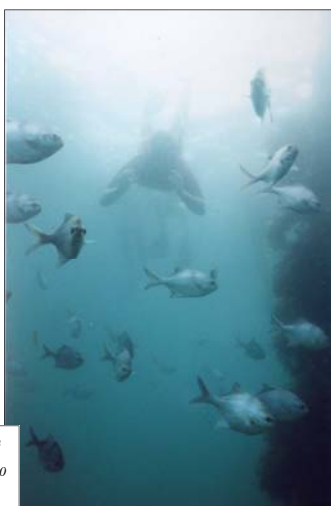
Diving under the Jetty with Sweep M Stacey, Nikonos 5 wide 20 mm

should be up and running by end of February 03