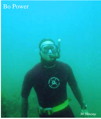
First time Freediving 13 metres! Nikonos 15 mm lens, f stop 11, 3 metres distance, no flash

“put all your money into buying the most comfortable silicon mask”