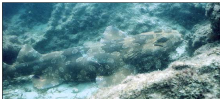
I don't think I have ever seen so many wobbegongs in the same area

“put your money into buying the most comfortable silicon mask”