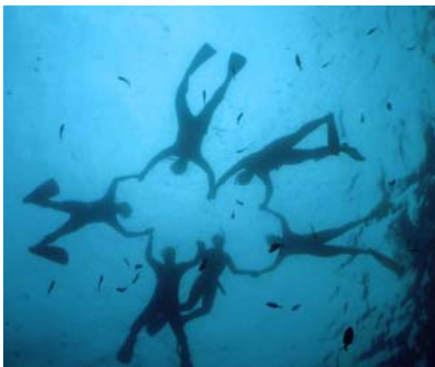
M Stacey, Nikonos 5 wide 20 mm