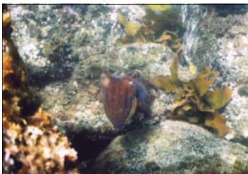
Cuttlefish in the Aquarium M Stacey, Nikonos 5 wide 20 mm

Mary-Anne Stacey 2 Chelmsford Ave., Millswood 5034 Phone: 08 8293 5885 Mob: 0419 804 685 Fax: 08 8351 1937 email: mstacey@senet.com.au