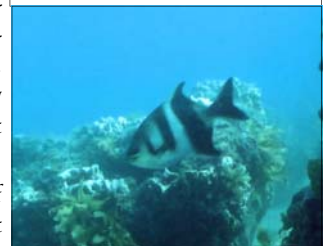
Banded Sweep Mary-Anne Stacey, Nikonos 5, 20 mm lens

Diving in Qld warm water,, NO Wetsuit? Make sure your divers have positive buoyancy on the surface. By wearing a buoyancy vest