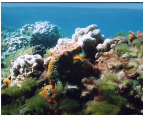
Sponge growth on the rocks at South Reef