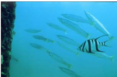
Old wife and many Pike underneath Port Noarlunga Jetty M Stacey, Nikonos 5 wide 20 mm